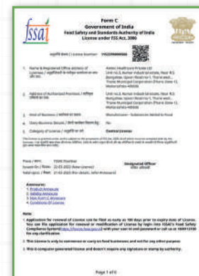
FSSAI CERTIFIED Food Safety & Standards Authority of India