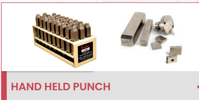
HAND HELD PUNCH