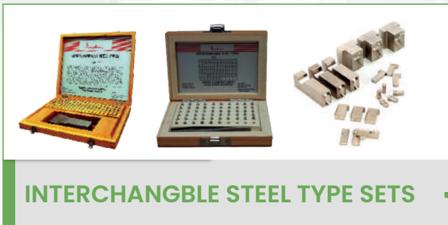
INTERCHANGIBLE STEEL TYPE SETS