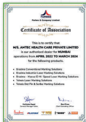
Authorised Dealer of BRADMA PRODUCTS