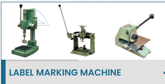
LABEL MARKING MACHINE